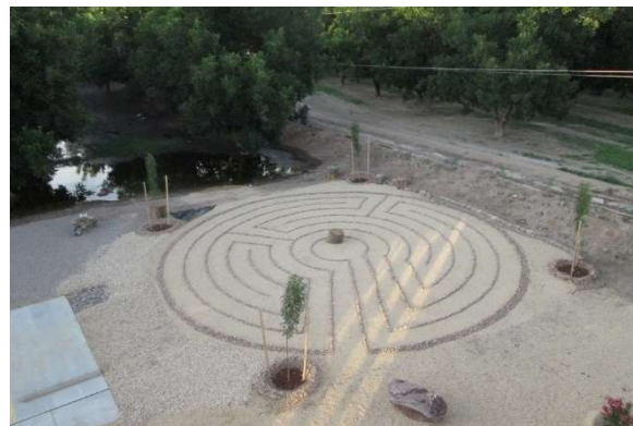
“You show me the path of life” Psalm 16:11

Begin your Lenten journey this year with a quiet morning at Holy Cross Retreat Center. We will spend a few hours praying for and with one another and engaging in contemplative practices including the outdoor labyrinth. Join us as we draw near to God and humbly consider our path with Christ toward the Cross. All are welcome—no matter your experience with prayer practices. Come and see. A sign-up sheet is in the Narthex and more information will be shared in Sunday announcements.