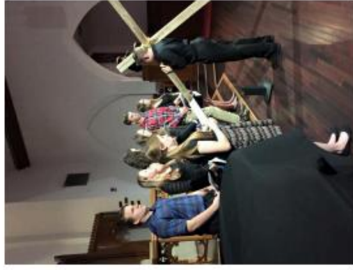
Youth Lead Good Friday Service

I am where I am today because of my congregation. I am here because of adult friends I made at my church who still treated me as a peer. I am here because growing up I had the opportunities to lead in the church, and it has become a part of my identity. So, I challenge you, how can you let youth lead in your congregation?