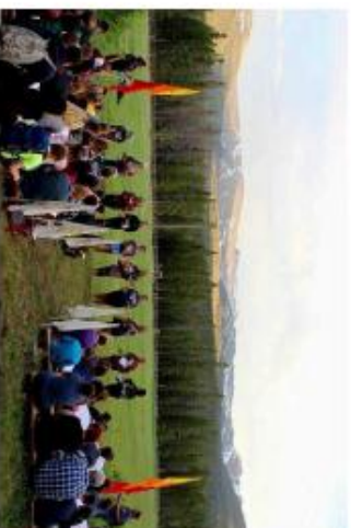
Worship at Sky Ranch 2016