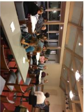
Some of the students and mentors in El Camino