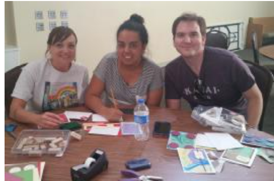
On October 23, our Card Ministry Group worked with some members of the Beloved Community to create cards with paper they made for a project.